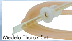
Medela Thorax Set