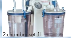
2-chamber set 1 l