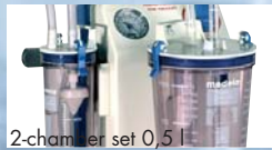
2-chamber set 0,5 l